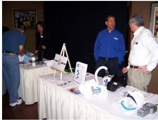
The exhibits and vendors