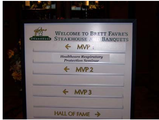
Preparing the Facility for the registered attendees