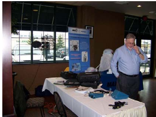
Tables for Registration and Resources in Respiratory Care