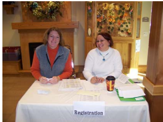
Tables for Registration, New Membership Materials and Resources in Long Term Care