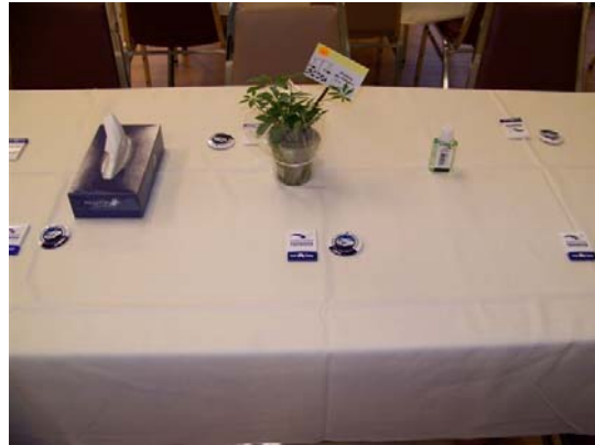
Preparing the Facility for the 100 registered attendees