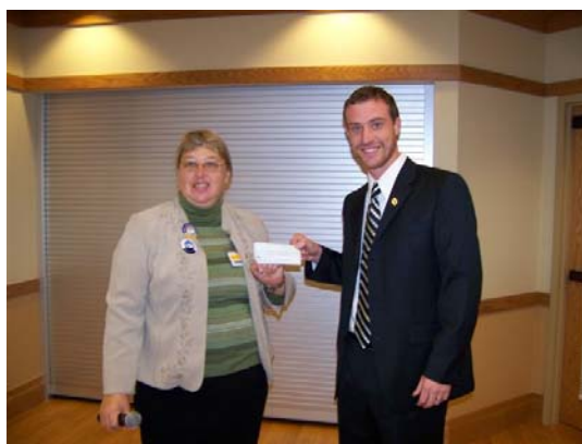
Donation to the Alzheimer's Association