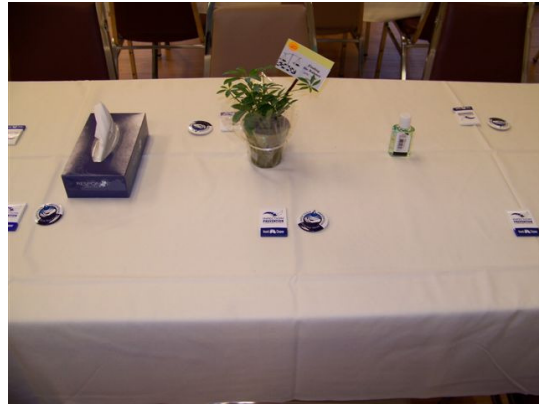
Preparing the Facility for the 100 registered attendees