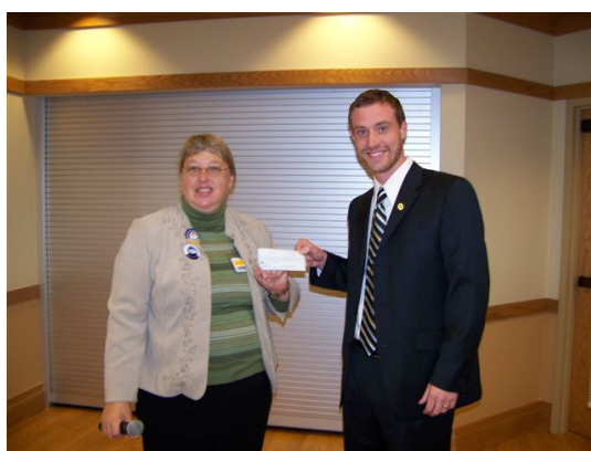
Donation to the Alzheimer's Association