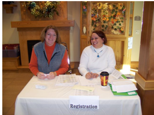
Tables for Registration, New Membership Materials and Resources in Long Term Care